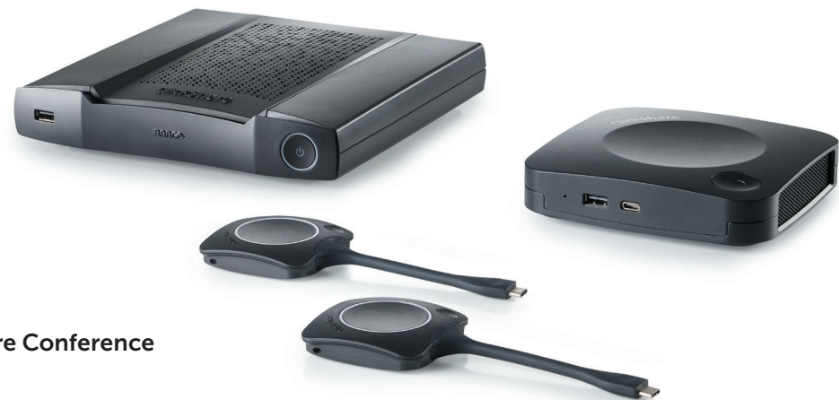
Barco ClickShare Conference

Discover the combinations of superior wireless conference solutions from Poly and Barco for all your meeting rooms . All tested and fully compatible.