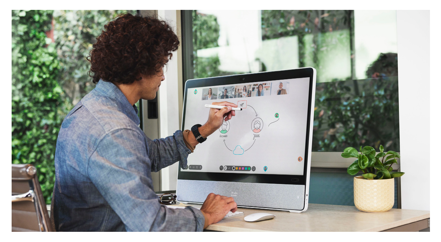
Figure 1. Whiteboarding in a meeting with the Cisco Desk Pro

The Cisco Desk Pro is an industry-leading intelligent collaboration device for desks and shared spaces. Collaborate, co-create, and annotate on an interactive, touch re-direct, 4k-touch display. Whether you set it up in the native Cisco Rooms experience for a Webex-first experience and advanced third-party video interoperability or configure the Desk Pro for the native Microsoft Teams, the Desk Pro is perfect for any desk.