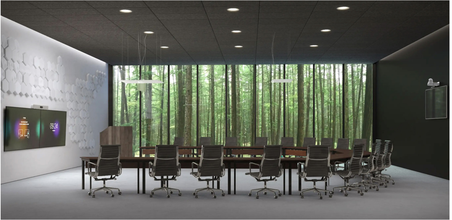
Figure 1. Webex Room Kit Plus PTZ 4K bundle with an additional Webex Quad Camera unit in a large conference room

The Webex® Room Kit Plus PTZ 4K Integrator Bundle is a powerful collaboration solution that integrates with up to two flat-panel displays to bring more intelligence and versatility to your collaboration spaces. This package combines the performance of the Webex Codec Pro collaboration engine, the flexibility of the Webex PTZ 4K pan-tilt-zoom camera and the purpose-built Webex Room Navigator table stand control panel to offer maximum flexibility and premium video collaboration in scenarios where you need special camera placement, want to view objects close up, or view a wide area with pan-tilt-zoom capability.